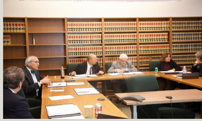
CJEO members deliberate

Chief Justice Cantil-Sakauye believes that CJEO's independence, transparency, and adaptability are key to its success. "As an independent body, CJEO plays a critical role not only for the bench, but also for the public, in creating a written body of work on judicial ethics that is understandable, accessible, and evolves as new challenges face the courts," stated the Chief Justice. Read more.