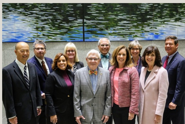
CJEO members in January 2018