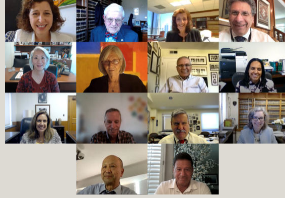
CJEO members and staff hold a virtual meeting during the COVID-19 pandemic